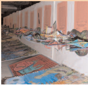
Student ceramics and artwork are conference hi-lights