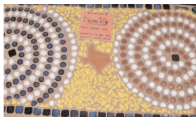
Diane Tilly Bench presentation