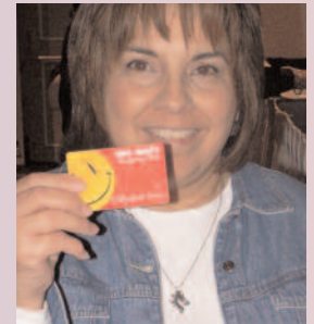
Saturday grand prize CASH CARD to Walmart a big hit with TAAE members