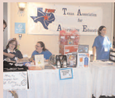
TAAE drawing table on public view and up for grabs with the right ticket