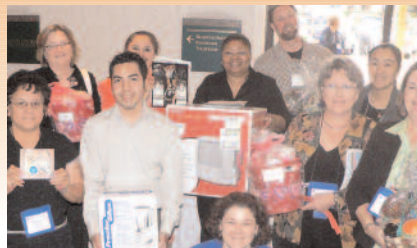
Food baskets, TV's, blender, CD's and more make for great TAAE give-a-ways