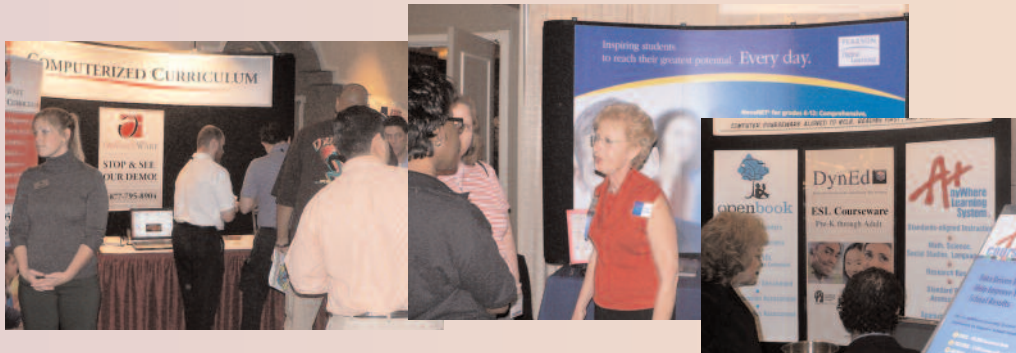
TAAE Exhibitors all touch the business side of attending the TAAE conferences supplying much needed information and technology