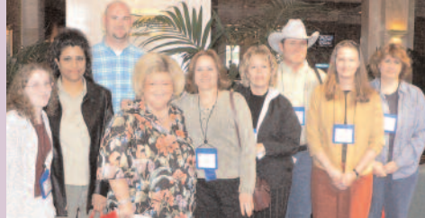
Perryton, Tx , Top of TX, AEC come as a school team to SanAntonio