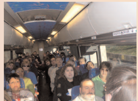
Three buses and 4 schools in SA get buses loaded up and rolling on Thursday AM