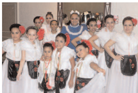
Judson Mexican Folk Dances performers