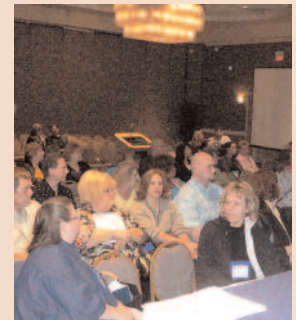
TAAE Business meeting is full during elections and TAAE website presentation