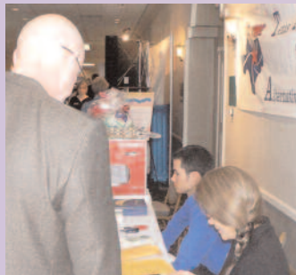
Naomi Shihab Nye with son signing autographed books for members