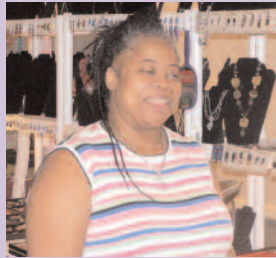
Exhibitor for the ladies... jewelry...