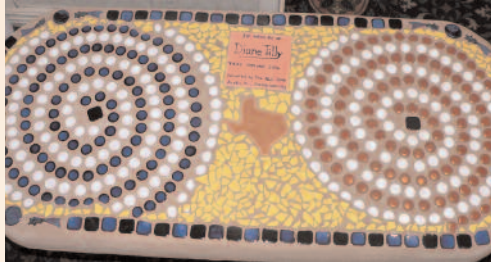
Bench created by Austin ISD students attending the Alternative Learning Center