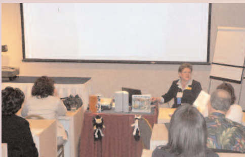
Tiered seating and executive chairs presented some classes with great comfort