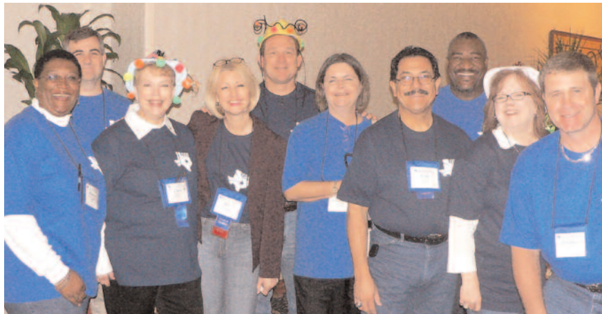
TAAE Conference Committee Volunteers!