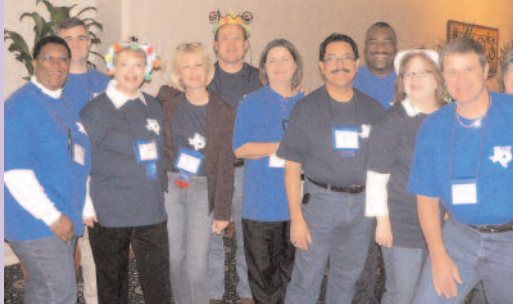
Conference Committee Volunteer's