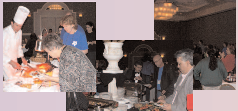
TAAE participants are fed well during Thursday and Friday receptions