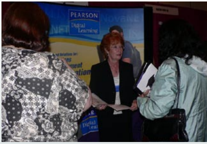
Exhibitor – Pearson Digital Learning – Making a Difference!