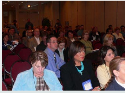
Conference workshop attendees