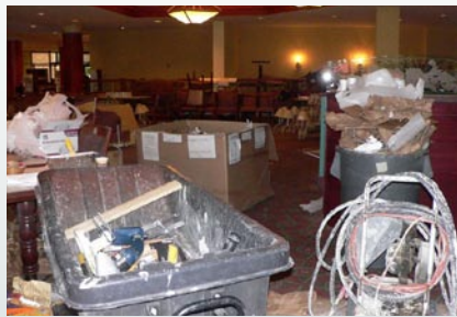
The hotel restaurant DMZ