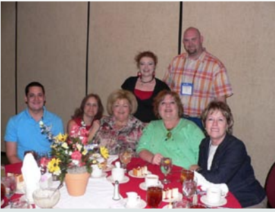
Top of Texas – Team , Perryton, TX at banquet