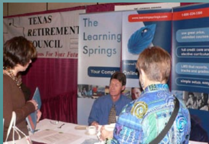
Exhibitor – The Learning Springs – Visiting with members.