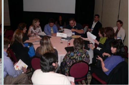
Discipline Alternative Education – Round Tables – A hit!