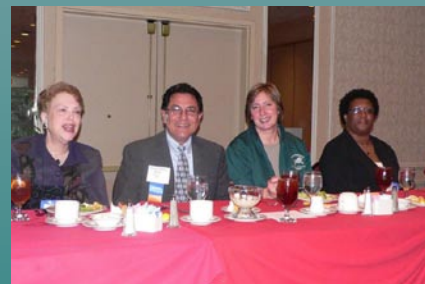
Board members enjoying the banquet