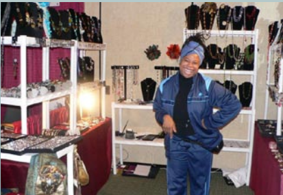
Unlimited Hands/Exhibitor – A big hit with the ladies!