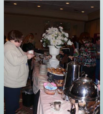
Great food in the exhibit hall