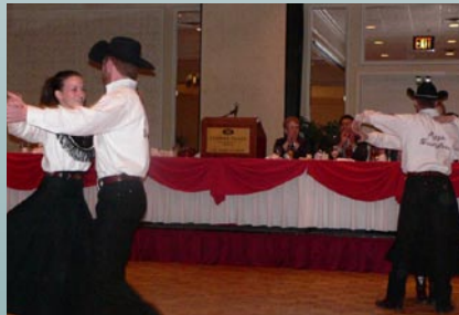
A&M Wranglers – Burning up the floor!