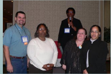
Thanks to our TAAE scholarship helpers!