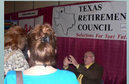
Thinking about retiring? We had you covered.