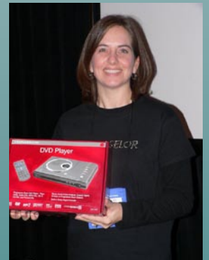
Winner!!! Gets DVD!