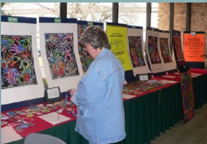
Art Auction Selections + More!